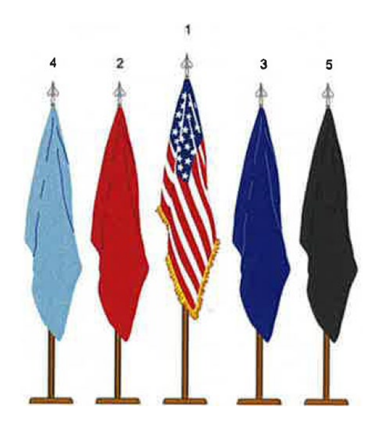
Figure 6. Flags displayed in group with staffs radiating.