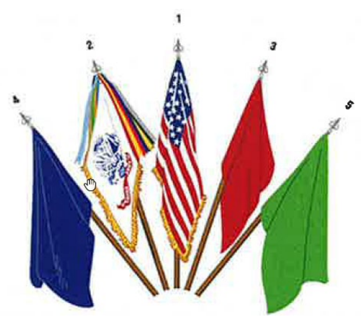
Figure 5. United States flag displayed in center of line.

a. When the flags are grouped and displayed from staffs radiating from a central point (Figure 3), the flag of the United States will be at the center and at the highest point. The identifying numbers 1 through 5 in the drawing refer to the flags listed in paragraphs 10a and 10b.