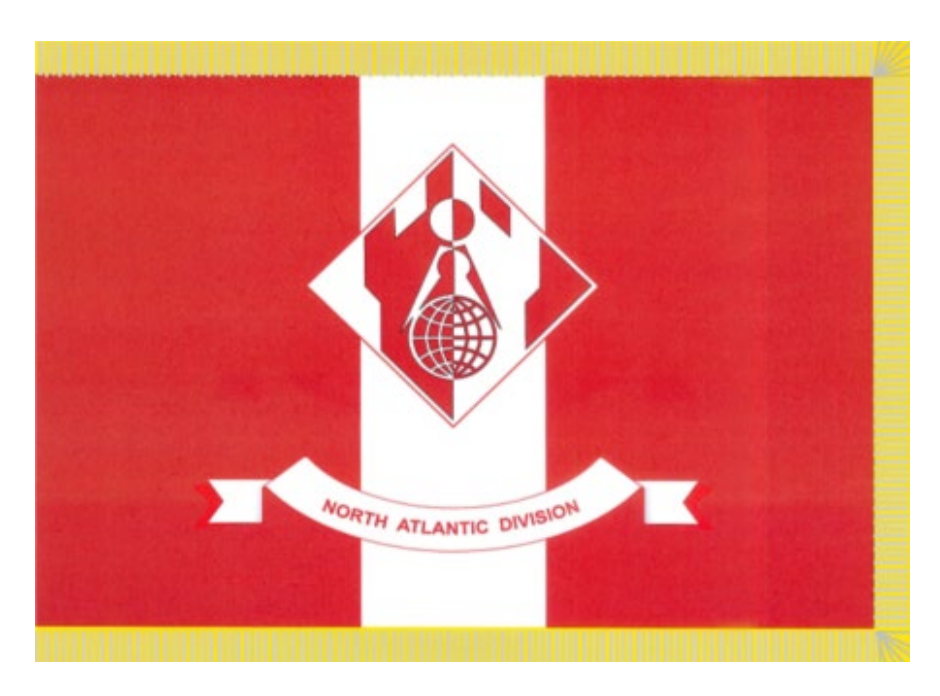
Figure 2. The major subordinate command flag of Engineer Divisions.